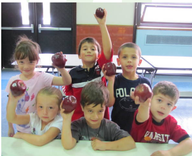
Many classes celebrated Johnny Appleseed's Birthday in September. In this photo, Kindergardeners show off their apples!